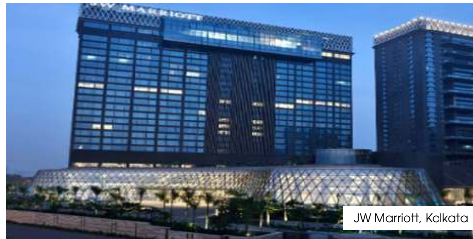
JW Marriott, Kolkata