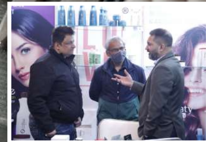
Salons looking to adopt a brand name or franchise