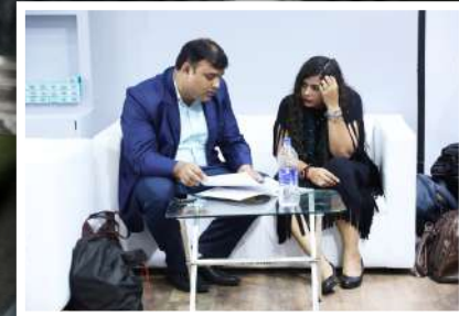
Investors looking for new business